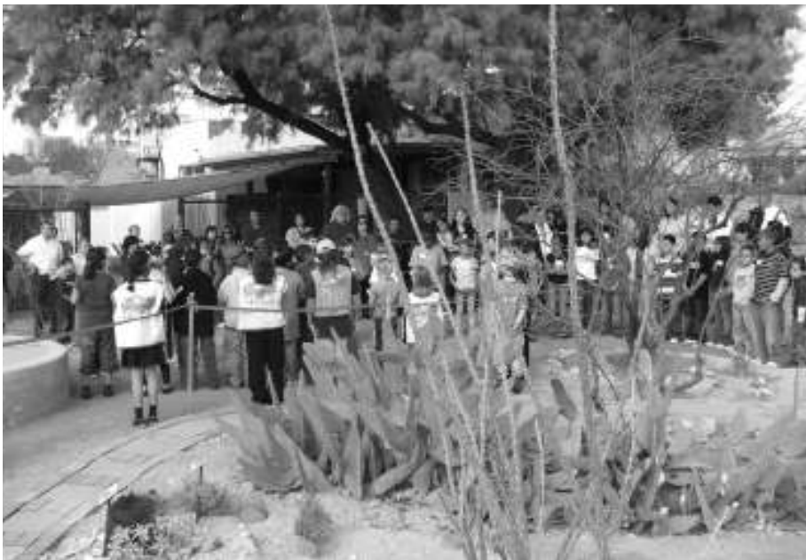
Feb 20, 2007, Ribbon Cutting Ceremony for Cactus Learning Garden The museum invites all the neighbors to “take a walk in the Garden”