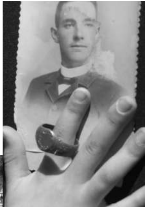
Above: A fourth grader tries on the giant's ring