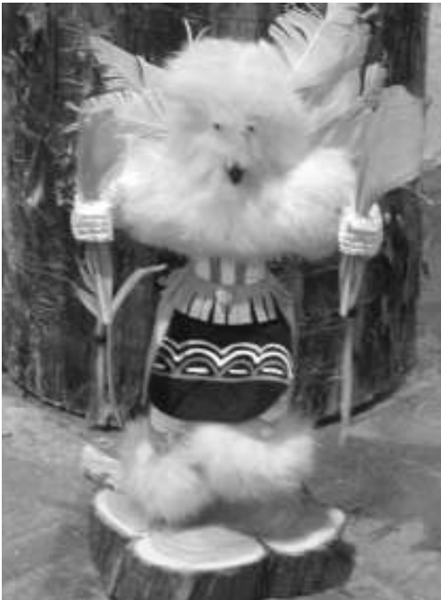
Owl Katchina donated for the 2007 auction.