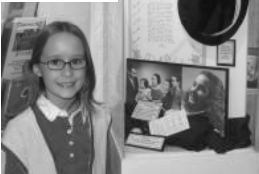
Docent shows her exhibit for Dia de los Muertos

NOTE: If you wish to donate to other schools so they may participate in school field trips to La Pilita, call the museum for details.