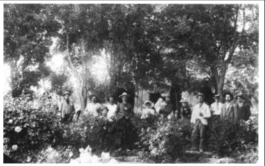
Beautiful Rose Garden in Carrillo's Garden. This site featured the first public park complete with gardens, ponds, and the first ice cream sale!