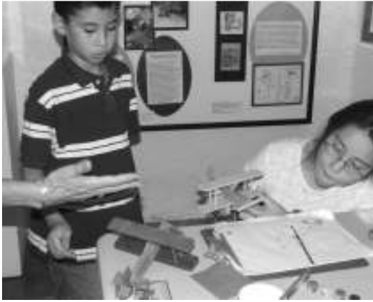
Docents complete bi-planes for the "Tucson Firsts" exhibit. Docents contribute to exhibits as well as give tours.